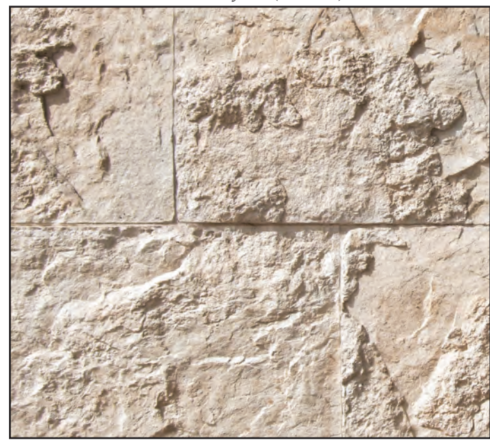
COLOR: EMBASSY BLEND

1/4" Full Smooth Tooled Grout Joint (nominal)